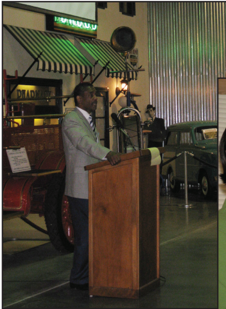
Mayor Osby Davis speaking on the State of the City at the Vallejo Chamber of Commerce Legislative Day.